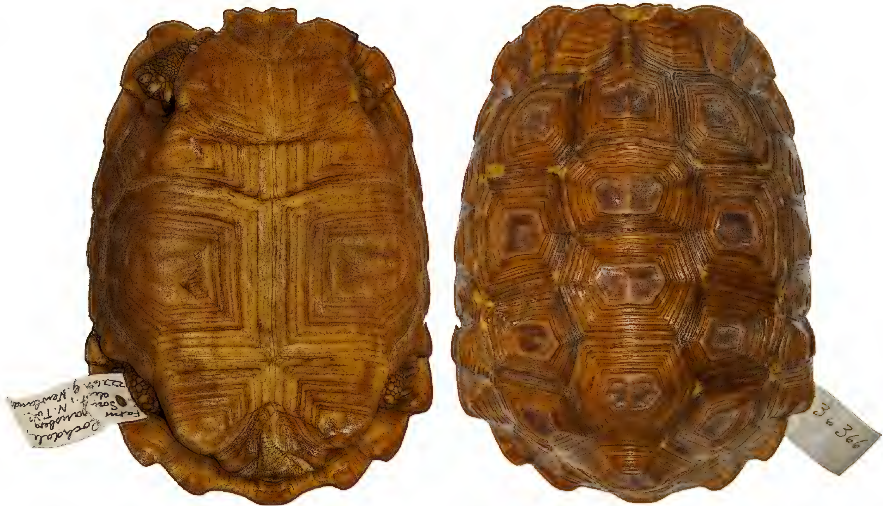
Fig. 3. Lobatse Hinge-back Tortoise ( Kinixys lobatsiana , TM 36366) collected at Rochdale Farm, Waterpoort, from the Ditsong National Museum of Natural History.

2017). This record likely corresponds to a museum specimen housed at the Ditsong National Museum of Natural History (TM 36366) collected in 1964 by G. Newlands on Rochdale Farm, Waterpoort. Rochdale Farm lies on the northern slope of the Soutpansberg, just east of Waterpoort. A morphological examination of TM 36366 confirms that it represents K. lobatsiana (Fig. 3). Broadley (1993) suggested that this specimen might have been “swept through the gorge by the Sand River during a flood” to reach its collection site, while Boycott (2014) added translocation by humans as another possible explanation. Considering that K. lobatsiana is confirmed from two other properties on the northern slope of the Soutpansberg Mountains, 22 km away from the collection site of TM 36366, that record no longer appears to be an outlier. The present evidence rather suggests a continuous distribution of K. lobatsiana along the northern slope of the western Soutpansberg.